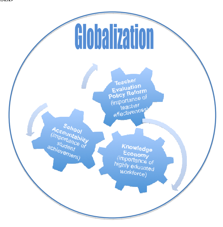
Figure 1. The knowledge economy, accountability, and teacher evaluation policy reform in the context of globalization