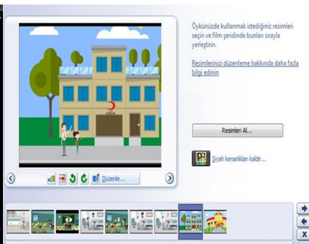
Figure 3. Editing the story in MS Photo Story 3