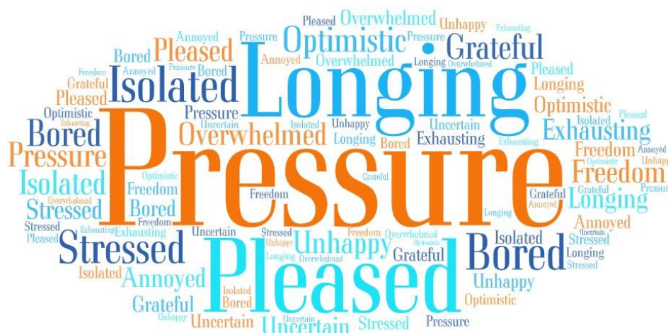
Figure 6. The emotions that the pre-service teachers expressed in their digital stories

Most of the participants stated that they had difficulties during the emergency remote teaching process. The reasons that cause pre-service teachers to have difficulty in the process are: having too many homework and projects, technical problems, difficulty in finding a suitable study environment, difficulty in understanding the course content or homework, and difficulty in communicating with the instructors and friends. Participants described themselves as overwhelmed, exhausted and stressed in this situation. Participants felt lonely due to staying at home and longed for their friends, school environment and social life at campus. In addition, it is found that the pre-service teachers were satisfied with the continuation of the education process and were hopeful about the future, despite the difficulties and motivation issues they have experienced during this process.