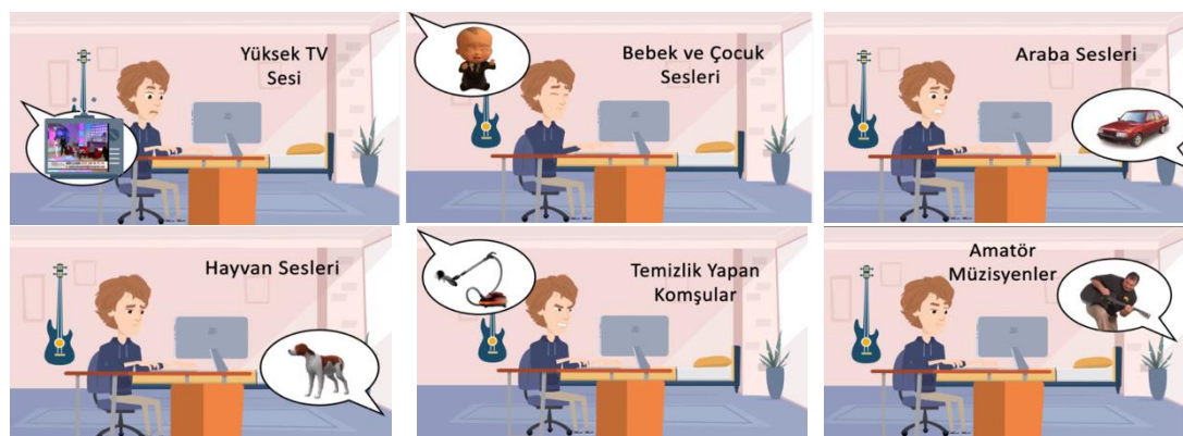
Figure 5. Problems in organizing the working environment during the emergency remote teaching

Under the category of organization of the work environment; the pre-service teachers complained that they could not find a suitable working environment. One of the participants expressed his opinion as follows. “Lack of finding a quite environment to listen the class. If I need to give an example from myself: I have six siblings, my parents, and my grandmother living in the house. Moreover, my uncles and aunts come home all the time” (S2, Questionnaire). The screenshots of the digital story prepared by one of the participants about the problems related to the working environment are shown in Figure 6.