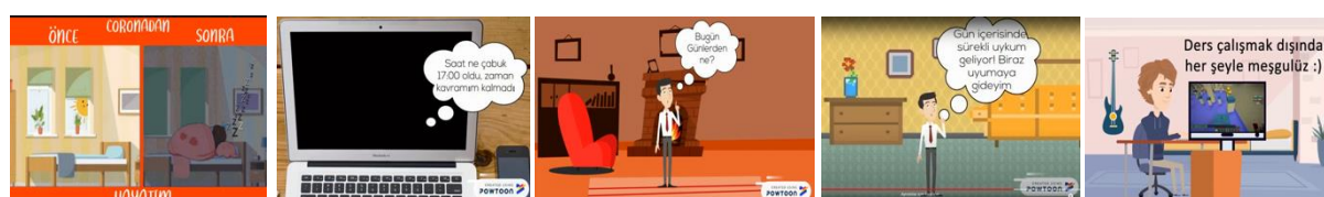
Figure 4. Sample screenshots of time management during the emergency remote teaching

The pre-service teachers stated that unlike face-to-face education in distance education, students cannot use their time efficiently due to the fact that they can follow the lessons whenever they want, and the home environment is too much comfortable. The pre-service teachers stated that they use the time they spend for transportation to the university campus to leisure activities. For example, they got busy with activities such as watching television and playing computer games at home, instead of using the time efficiently. They also stated that they were confused about the concept of time and day due to being at home all the time. Sample screenshots of the problems experienced by the pre-service teachers regarding time management during the emergency remote teaching are shown in Figure 4.