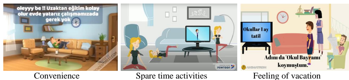
Figure 1. Sample screenshots from digital stories about pre-service teachers' expectations/thoughts at the beginning of the distance learning process

With the announcement made by Council of Higher Education (2020) that education at all universities was suspended, most of the pre-service teachers in this study made a perception that universities would be on a vacation for the rest of the semester. In addition, a few participants stated that the distance education process would be economical since there would be no transportation and food expenses that they usually spend when they have face-to-face classes. Figure 1 shows sample screenshots from the digital stories of pre-service teachers.