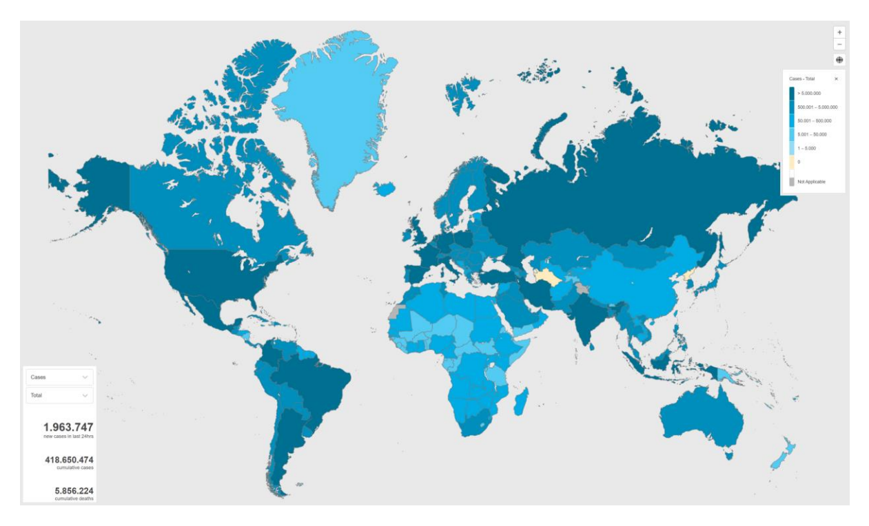
Figure 1: WHO Covid-19 dashboard

Maps have so far been the sources that people have tried to understand the world from the political, physical and economic aspects, and we have followed the developments throughout history through such maps. However, since the Covid-19 outbreak, which has seriously affected human life all over the world for more than two years, we have woken up to the new day with a map updated every day, and this is unfortunately the outbreak world map. This map of the World Health Organization highlights the countries affected by the coronavirus, the number of confirmed cases and unfortunately the deaths.<sup>1</sup>