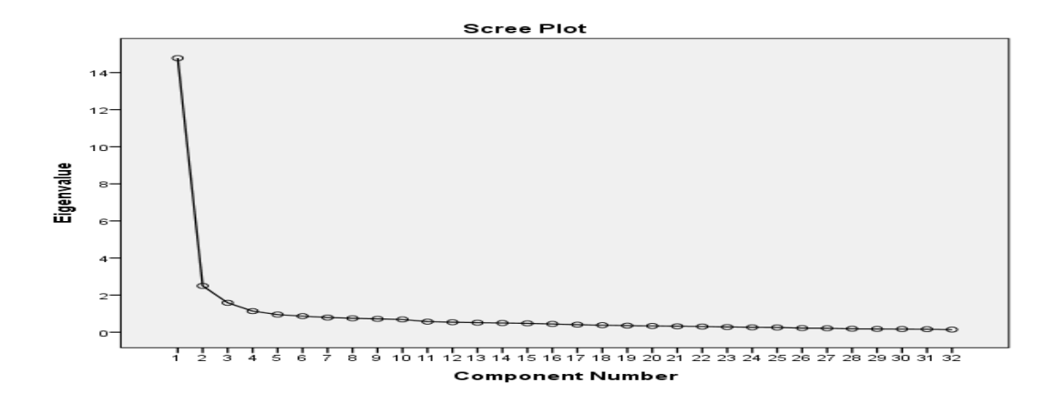
Figure 1. Graph of Eigenvalue Factor of the Scale

The values obtained as a result of exploratory factor analysis (EFA) regarding the scale and scale factors are given in Table 1.