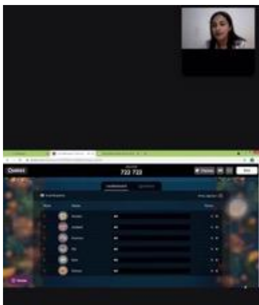
Figure 2. Screenshot from an observation of an online biology lesson

The study utilized online surveys and researcher observations as data collection tools to gather information about the experiences of biology and preschool teachers, as well as student teachers. Researcher observation notes were collected during the teaching practicum course in the spring term of 2020-2021, while online surveys were conducted at the end of the term. Both biology teachers and preschool teachers delivered their teaching through Zoom, and researchers observed each student teacher for four sessions, each lasting 40 minutes. Figure 2 presents a screenshot from an observation of an online biology lesson.